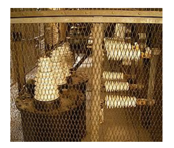
E.g. Faraday shield at Art Nouveau power plant in Heimbach, Germany (Photo above)